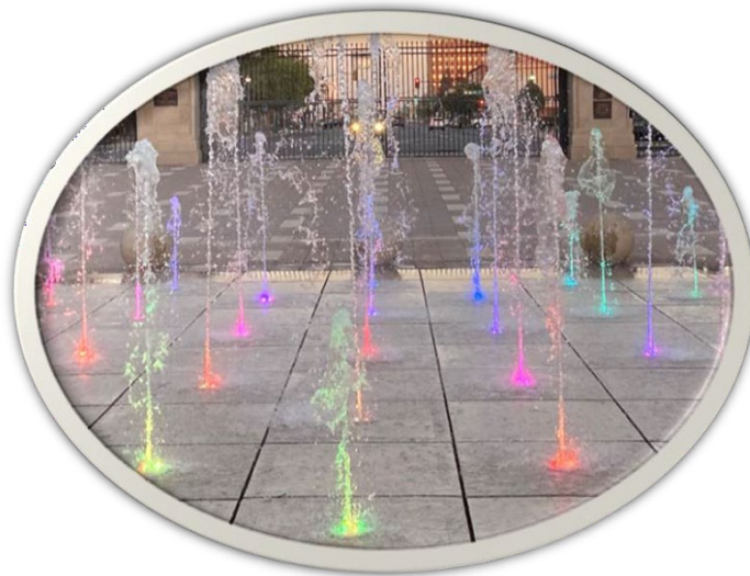
Orchestrated Water Show at Weber Point Fountain