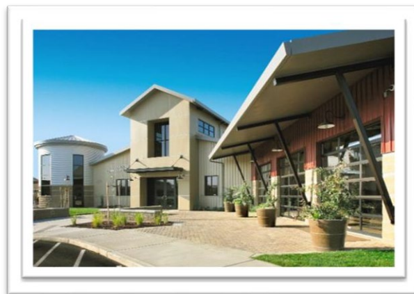
Arnold Rue Micro-Library & Community Center

The Report and Plan will be due at a date negotiated following contract execution.