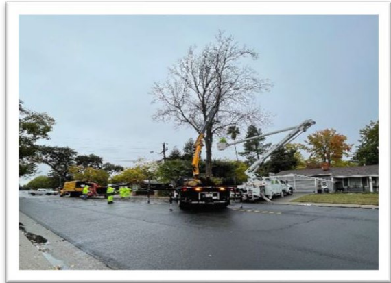
PW Tree Crew on Storm Duty