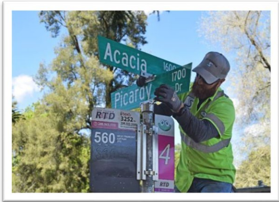
PW Street Sign Maintenance Crew