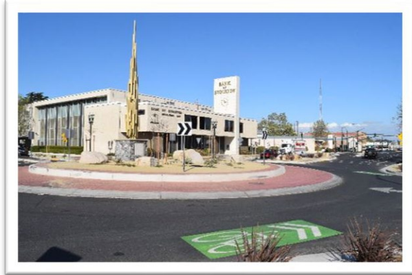
Miner Avenue Complete Streets Project with Measure K Funding